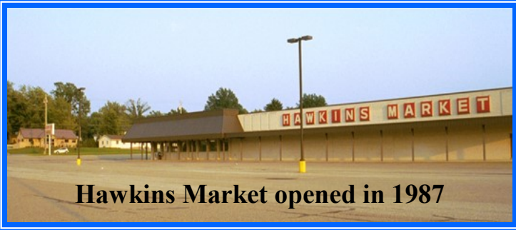
Hawkins Market opened in 1987