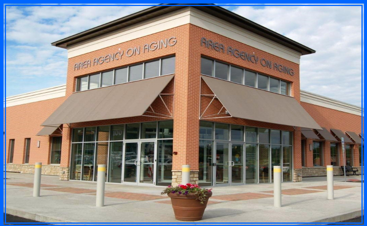
Hawkins Corner opened June 2013